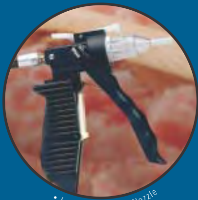
• Insta-Flo Gun and Nozzle