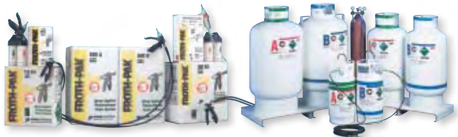
• Froth-Pak Disposable Kits